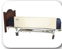
Padded Side Rail Protectors