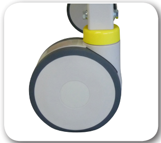
150mm Anti-Static Castors