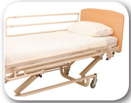
400HR Horizontal Rails