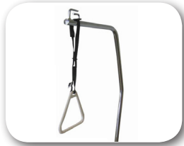
Self Help Pole