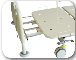
Pull Out Extension