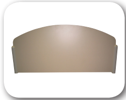
Aluminium Trimmed Crescent Style

* Most head and foot board styles are available in a range of colours on request.