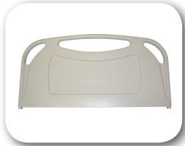
Sculpted Moulded Style